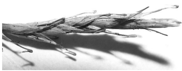
Geoff's excursion photo of Uncinia riparia .

It is from the Cyperaceae family (same family as Gahnia and Gymnoschoenus and Lepidosperma belong to). Uncinate is a botanical Latin term meaning hooked (specifically a recurved hook) and riparia means "of the river". The species often forms massive swards along flood flats of rivers but is also common in wet sclerophyll forest on slopes.