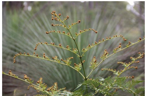
Bracken with grass tree backdrop.

After a feast of salads, 30 steaks, 50 sausages and platters of fruit, some of the group headed down to the neck to observe shearwaters and penguins.