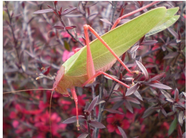
The same cricket four days later after its final moult with normal green wings but maintaining the pink body and leg colour.

nymphs of this species feeding on a dwarf red flowering Leptospermum in my back yard at Riverside in Launceston. Presumably because this plant has purplish/red foliage and is covered in red flowers, the nymphs were reddish pink. But more unusually, when they had their final moult to adulthood, the wings were green but the body and legs retained the pink colouration.