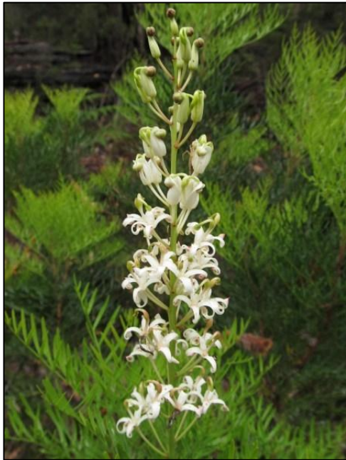
Guitar plant Lomatia tinctoria.