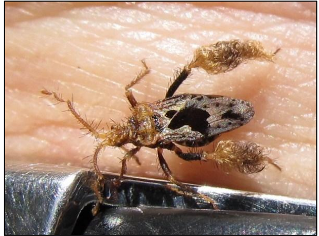
Furry-legged assassin bug Ptilocnemus femoratus.

A very pleasant, bountiful, close-to-the-city walk.