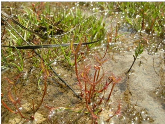
Drosera binata.

The term “carnivorous plant” was first used in 1760, in reference to the Venus Flytrap, a plant which Charles Darwin, in his “Insectivorous Plants” (published in 1875), considered the most wonderful plant in the world and certainly it has fascinated children and adults for many years since then. There are at least 500 different species of carnivorous plants belonging to about 20 genera in a variety of habitats all over the world (Camilleri 1998) and because of wider exploration many more species are being discovered. The term is colloquial and many of the species are not related although they do all have in common the ability to trap and digest animal prey.