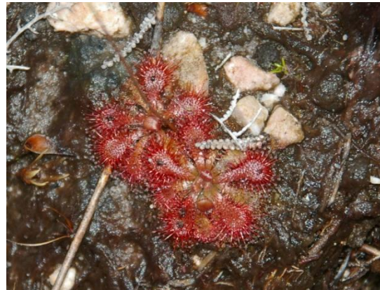
Drosera spatulata .

Tasmania has only two genera of carnivorous plants, Drosera and Utricularia , containing nine and eight species respectively (Clayton 2002), but bear in mind that molecular techniques may change the species concept of some of these species. They are not the large, breathtakingly beautiful plants of the tropical ecosystems but rather simple and delicate with exquisite small flowers but are equally as fascinating to enthusiasts from all over the world.