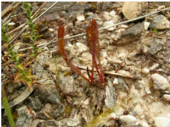
Drosera arcturi , large leaved form.

An abundance of water is essential for all carnivorous plants and they tend to grow in boggy habitats with plenty of water but with depauperate soils that are nutrient deficient. By devouring animals (the size of the trap is no doubt the delimiter of the prey size) these plants can supplement their diet and flourish in a hostile environment.