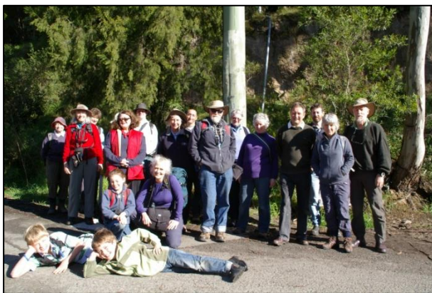
TFNC members at the start of the Cascades Track.