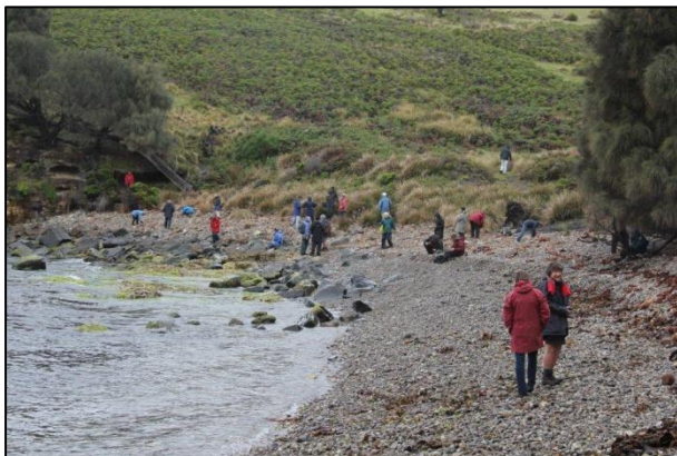
Field nats fossicking at Variety Bay.

The weekend was well attended with 38 field naturalists from Launceston, the northeast and Hobart. The weather around Tasmania that weekend was awful but we appeared to have escaped the worst of it with most rain falling at night. Here, I provide a very short summary of the weekend but a more detailed report will be produced later.