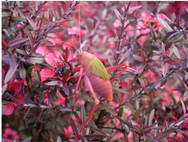
A predominately pink Caedicia simplex nymph on a red flowering Leptospermum.

The large 40-45mm green cricket (or Katydid) Caedicia simplex is common in coastal Tasmania and thrives in urban areas feeding on a range of native and ornamental plants. The soft, single 'zzzt' call of the males can be heard at dusk in backyards throughout Tasmania. These crickets are normally entirely green to blend in with plant foliage where they secrete themselves during day light hours. Recently I noticed a number of