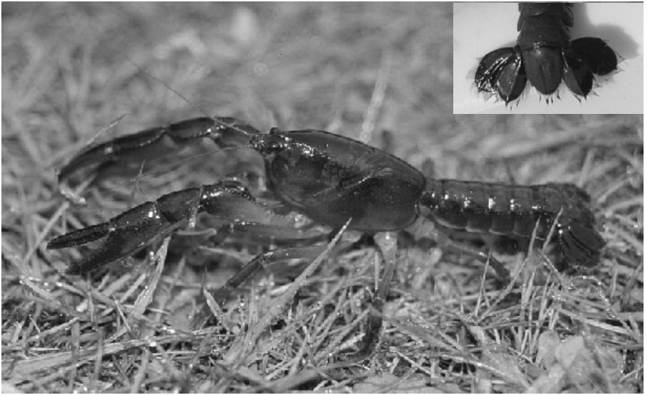
Figure 2. Engaeus spinicaudatus . Inset shows terminal spine on the outer ramus of the uropod.