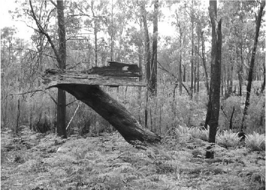
Figure 6. Forested riparian habitat of E. spinicaudatus along Ruby Creek. Note that this photo was taken about one month after the site had been heavily burnt, but the density and composition of the understorey and overstorey is still quite obvious.