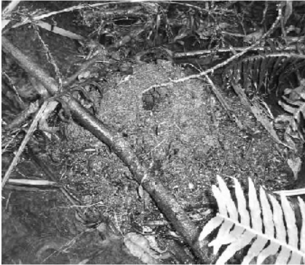
Figure 4. Typical burrows of E. spinicaudatus along Ruby Creek. Note the freshly dug soil around the burrow entrance.

River (Donnolly Creek) in May 2005, located about 800 m east of Ruby Creek as part of the fauna management procedures under the forest practices system.