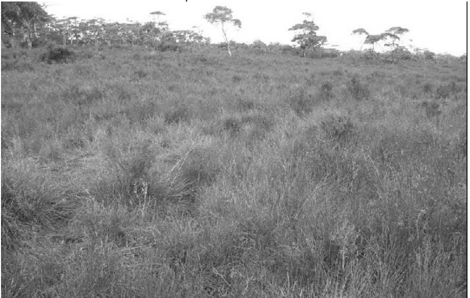
Figure 3. More typical buttongrass moorland habitat of E. spinicaudatus .